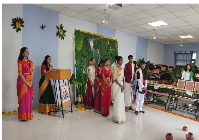
Glimpse of Cultural representation Competition- वैविध्यम्