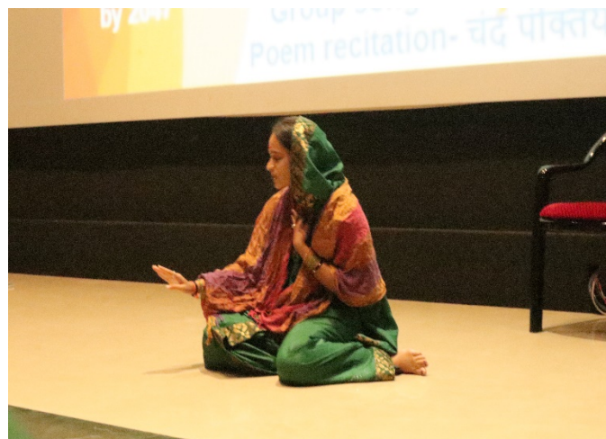
Glimpse of monoact competition

During these events, the video-clips of winning teams of documentary competition was also projected on screen. Total 5 teams had participated and prepared insightful and meaningful documentaries on the theme of patriotism/history.